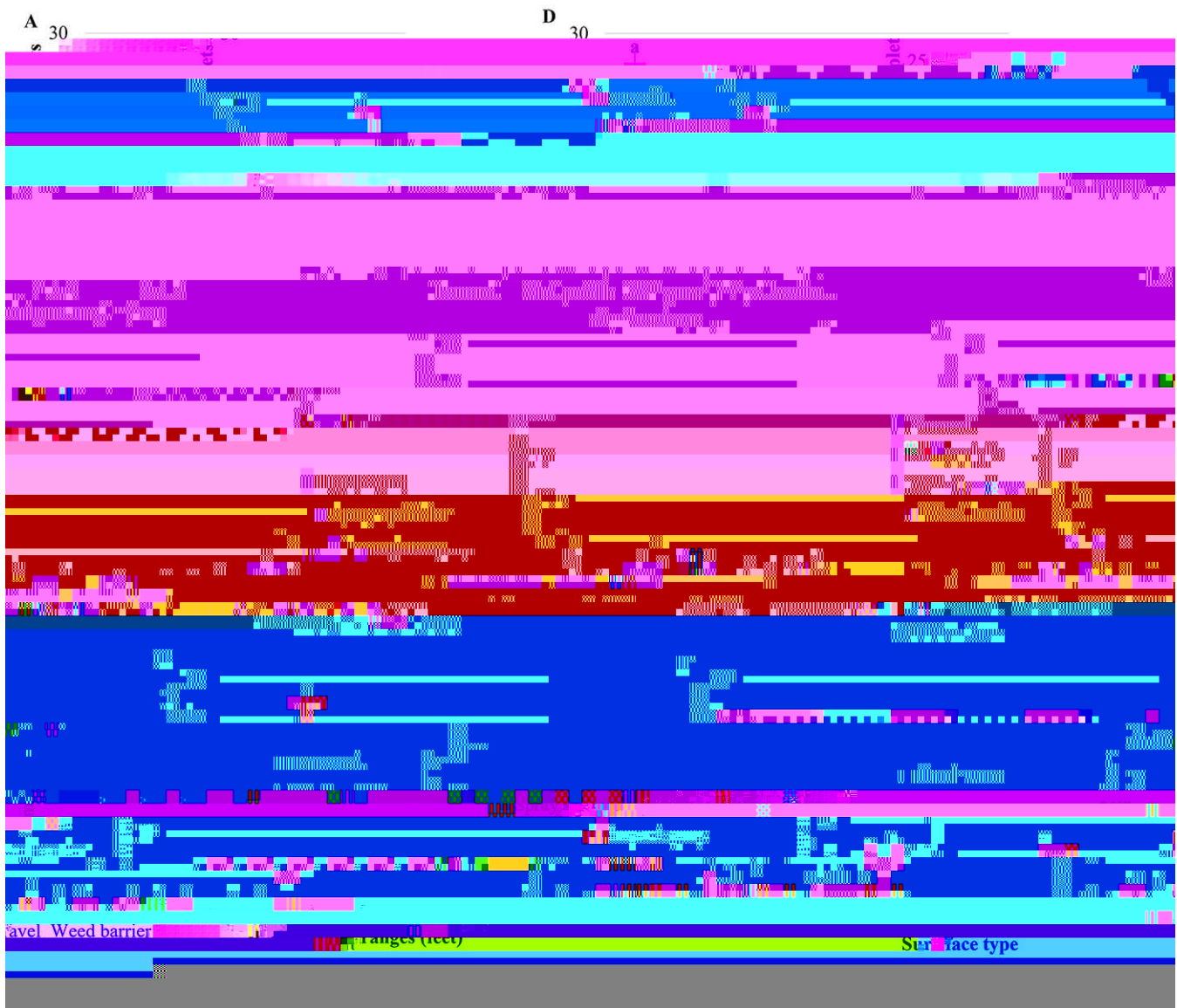
Figure 3: Average number of water droplets from different surfaces using three different irrigation types. Left panel: results arranged by irrigation type (A: Hand wand, B: Spray sprinkler, C: Impact spray); right panel: results arranged by height (D: 1–2'; E: 2–2.5'; F: 2.5–3'). Bars with different letters are statistically significant at P < 0.05 .